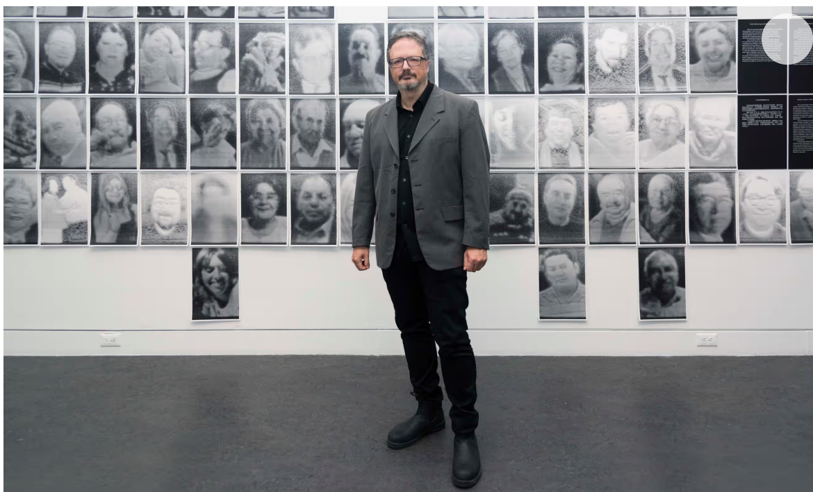
📷 Rafael Lozano-Hemmer: 'For me, art has always been a good vehicle for mourning, but also a vehicle to express continuity.' Photograph: Photo by Jonathan Dorado

Mexico-born artist Rafael Lozano-Hemmer invites people to contribute pictures of loved ones who died during the pandemic for an unusual installation