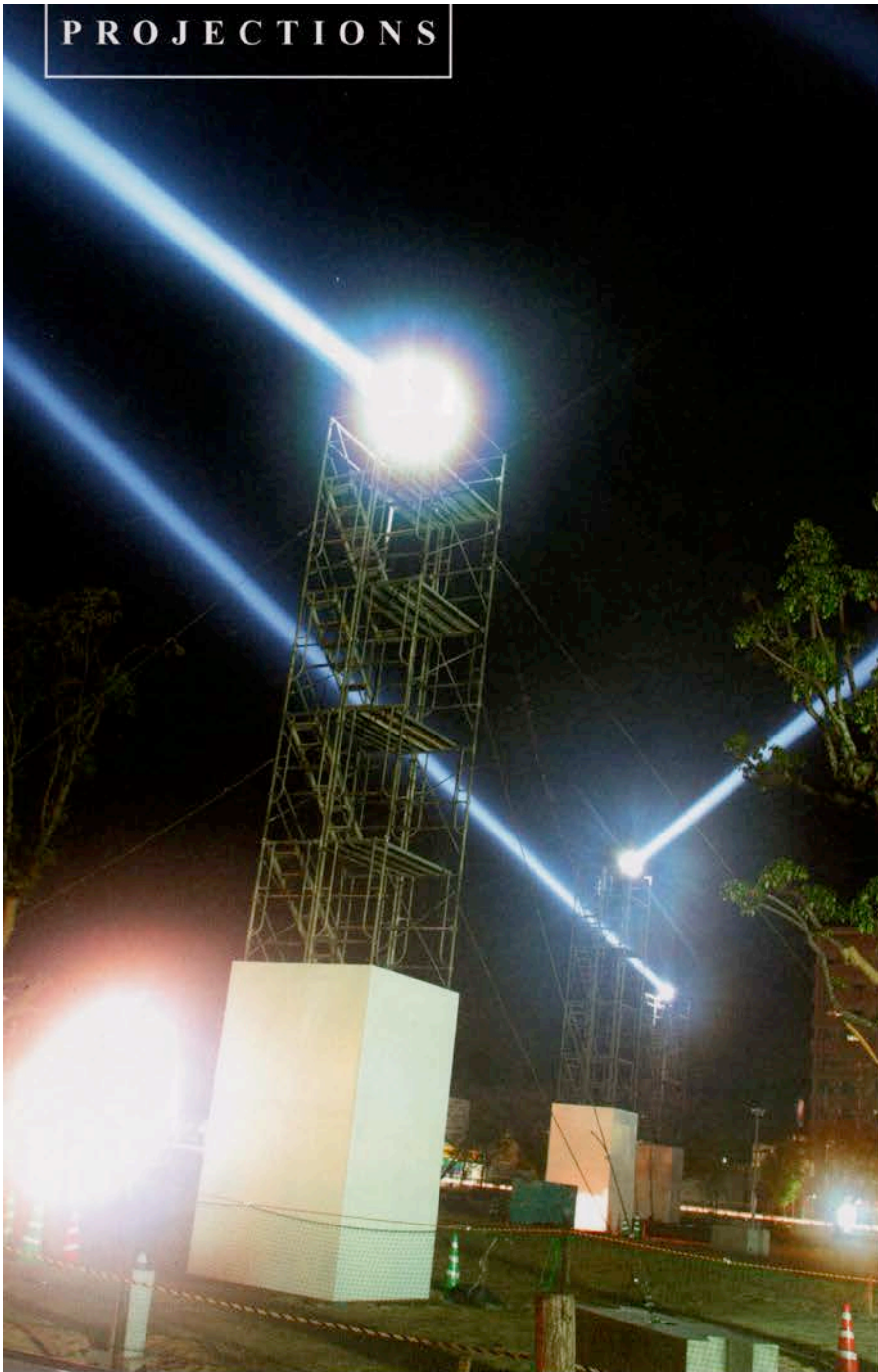
'Amodal Suspension' by Rafael Lozano-Hemmer at the Yamaguchi Center for Arts and Media.

lability, more silence, more abstraction, more uselessness. 5