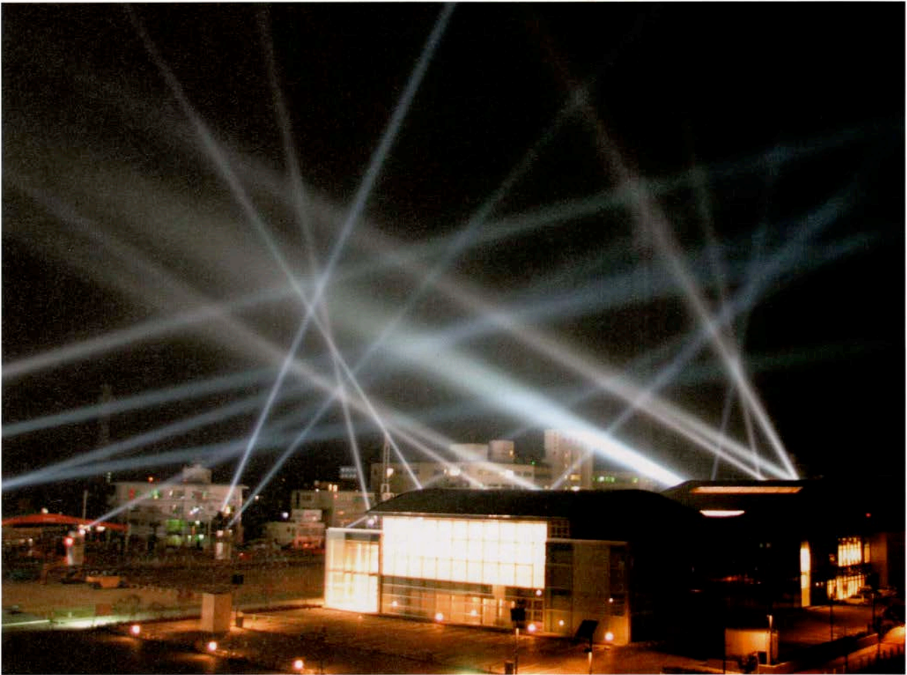
Rafael Lozano-Hemmers 'Amodal Suspension' at the opening of the Yamaguchi Center for Arts and Media.