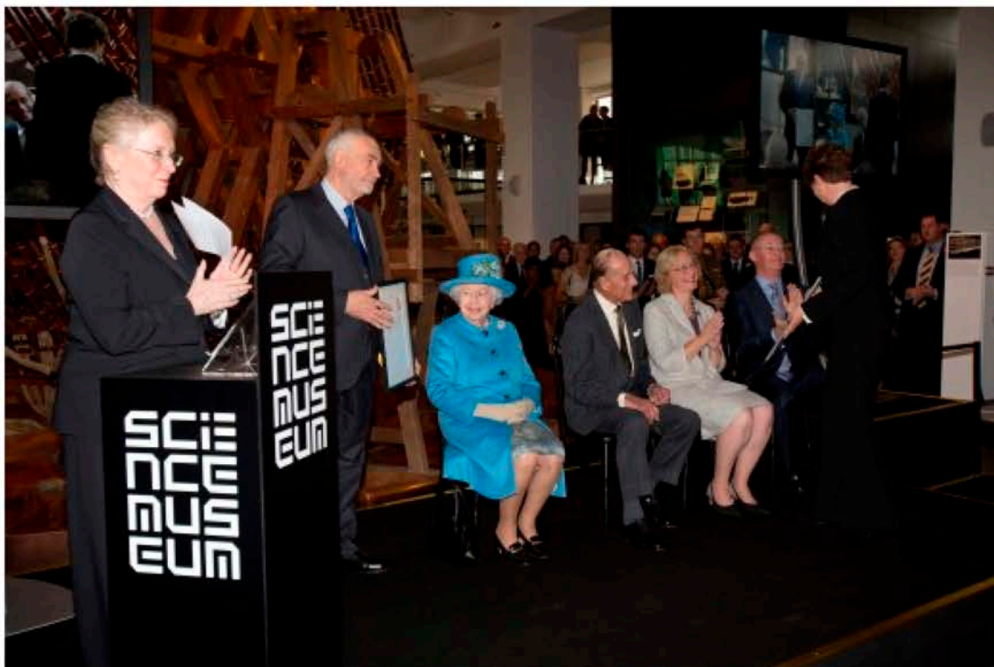
The Queen is presented with a Science Museum Fellowship at the opening of the Information Age gallery.