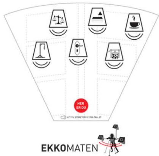
Figure 5. Ekkomaten and a map showing the layout of the square, with symbols for the position of each of the six echoes that people could search for. Graphics by: Jette Bæk Møller.