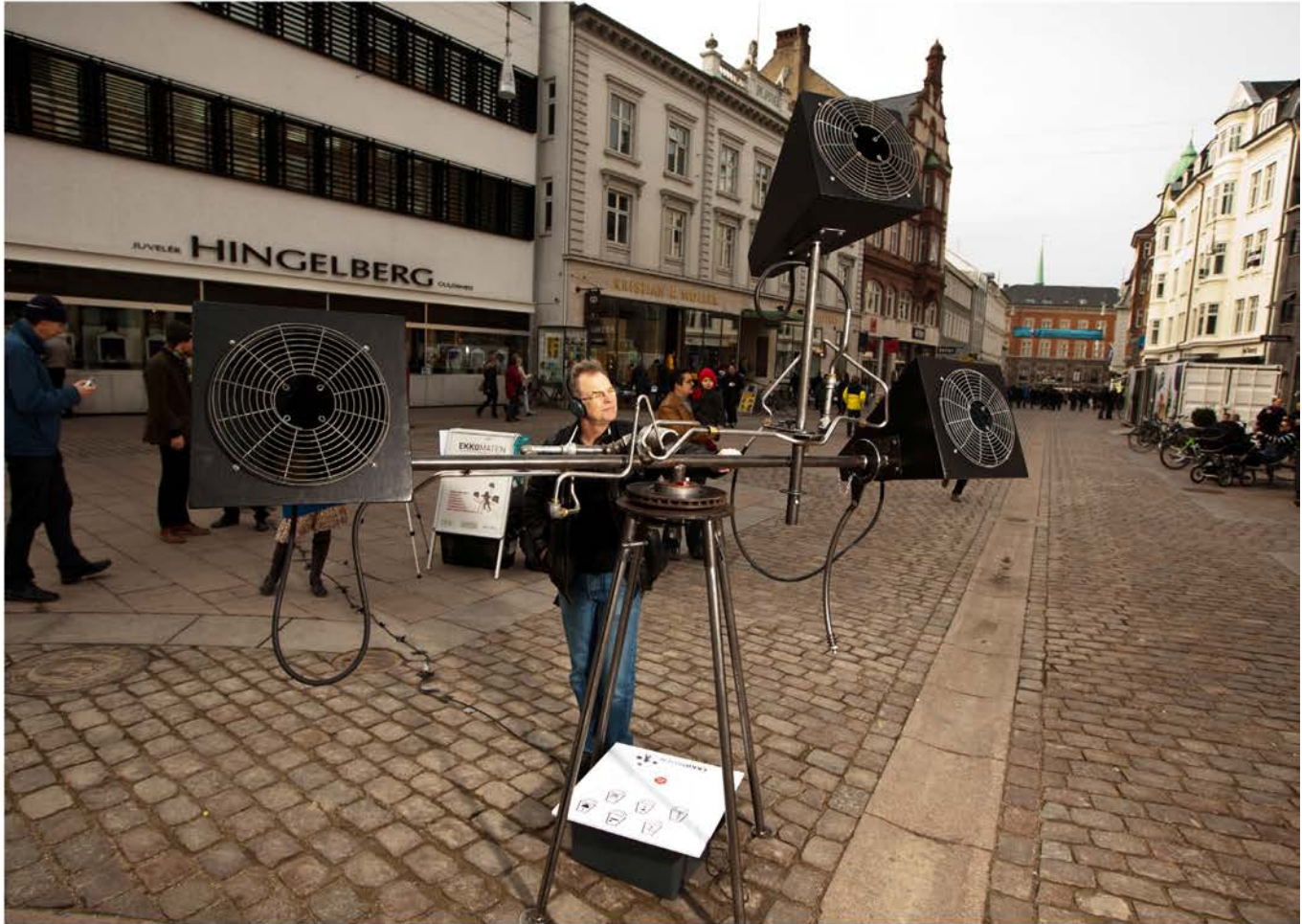
Figure 4. Ekkomaten, on display at Store Torv, Aarhus in March 2012.