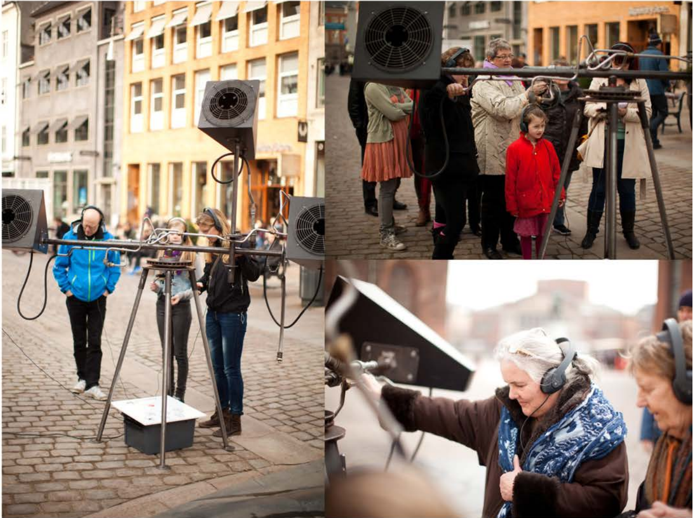
Figure 6. Different forms of interaction and listening.

disjunctive synthetic operations for constituting immediate and at the same time fielding events of experience. The way an entire urban media ecology shifts in its potential through an embodied and affectively engaging process enables us to think such technologies as technologies for emergent experience. At the same time, considerations for emergence have to be complemented with the processes of perishing and its extension of a field of experience, its virtual structuration. The main challenge is not only to make things felt in their immediate presence in experience but also to make their potential ways of causation or continuation a vital and empowering part of it.