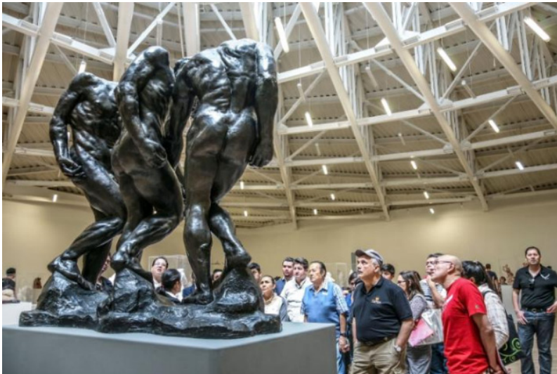
Gates of Hell sculpture, from Carlos Slim's collection

Another is 'Valle de Mexico', a landscape from 1897 of the very spot where the Soumaya now stands. It's a strikingly rural vision, and proof of how much the city has mushroomed.