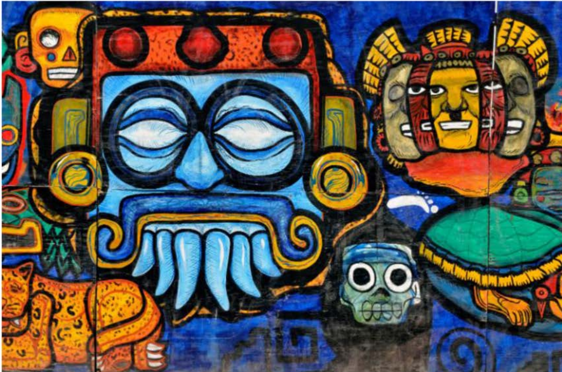
Graffiti painting on a hoarding, Mexico City