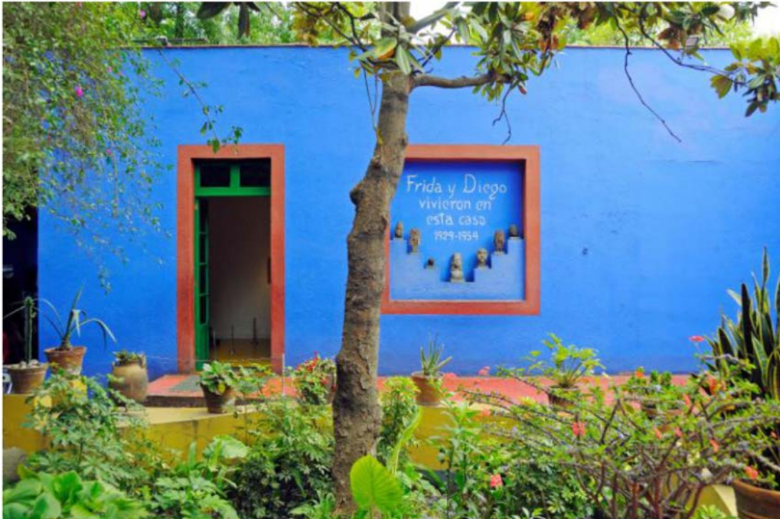
Casa Azul, Frida Kahlo's home