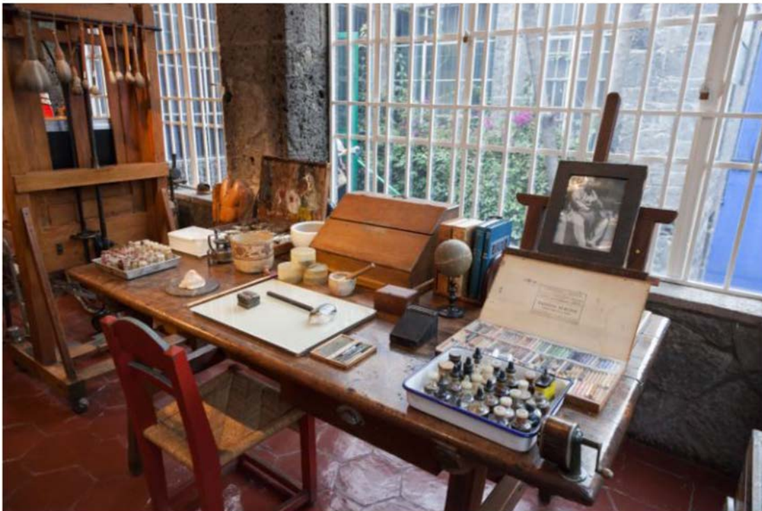
Frida Kahlo's studio in Casa Azul