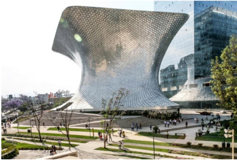
Museo Soumaya, designed by Mexican architect Fernando Romero

The latter's glimmering exterior calls to mind an outsized, aluminium hourglass; its interior presents a mish-mash of art, European and Mexican, from the 15th to 19th Centuries. It has been criticised by connoisseurs as an unwieldy, barely curated charge through art history, but, if the scores of school groups are anything to go by, it squarely meets Slim's own aim: to offer his countrymen free access to the great artists of Western civilisation without leaving Mexico City.