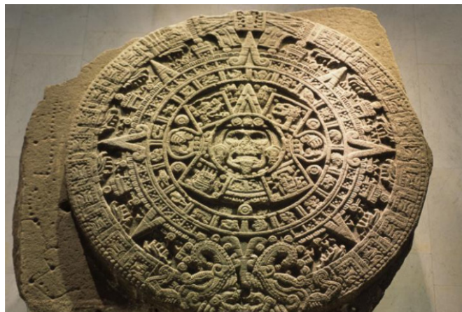
Stone of the Sun, in the National Museum of Anthropology

There must have been 200 people standing before it on the day I visited and, incredibly for a tourist attraction in 2016, nobody resorted to their smartphone camera or to grabbing a selfie. To a man, woman and child, everyone stood in awe.