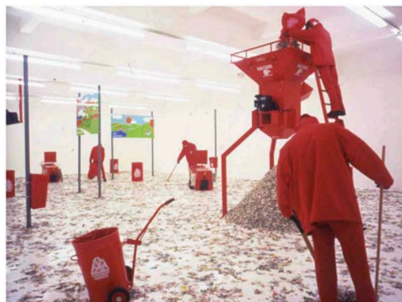
Michael Landy, Scrapheap Services , (1995). Installation view Chisenhale Gallery, London, 1996. Tate Collection, London.

The present exhibition focuses on an expansive installation titled Frankfurter Block , [2016] 2014, 2012, which exemplifies the artist's complexity and laboriousness. — Carol Civre