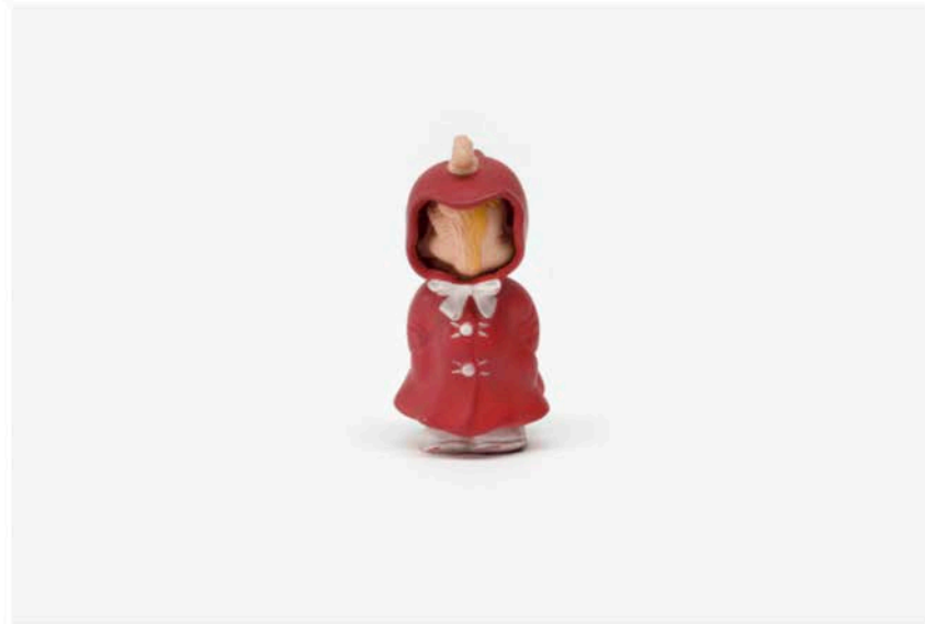
Roni Horn, "The Selected Gifts" (1974–2015) (detail).