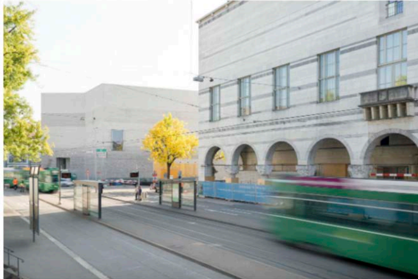
The newly-renovated Kunstmuseum Basel (right) with the adjacent new building (left).

Once again, Art Basel is upon us. Everyone is getting ready to walk miles and miles of art fair aisles perusing the best art on the market from all the world.