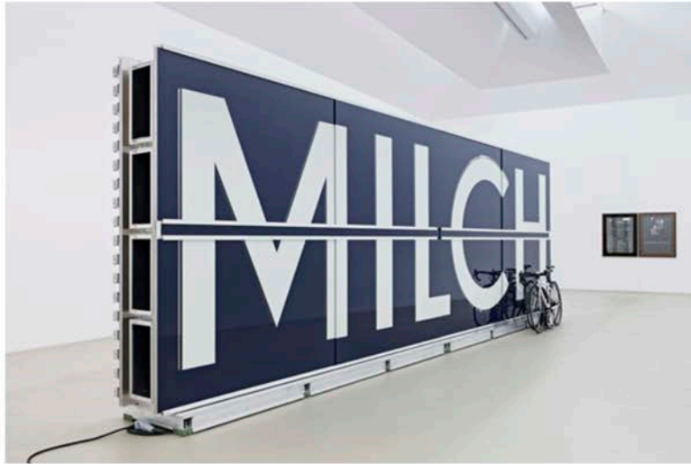
Reinhard Mucha, Ohne Titel (MILCH) , [2014] 1979 (Detail). Courtesy of Kunstmuseum Basel