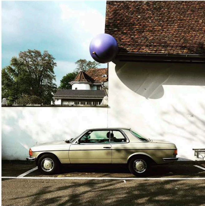
A car parked underneath a Tobias Rehberger-designed water spout, found along the path of "24 Stops."