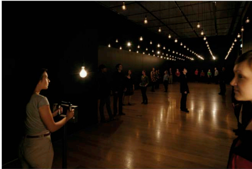
Rafael Lozano-Hemmer, Pulse Room, 2006.