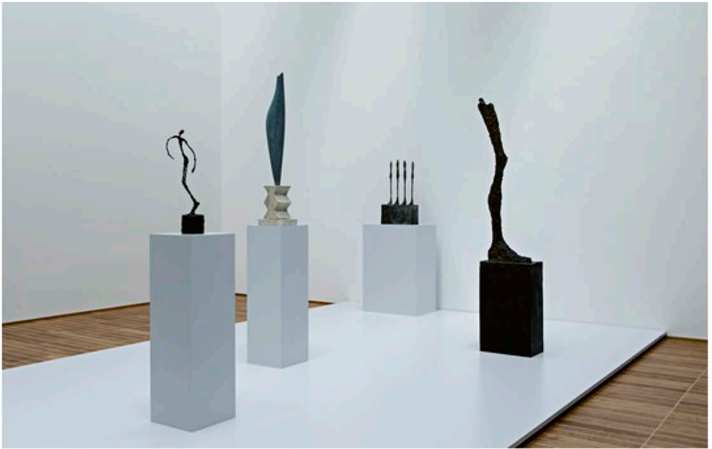
Sculpture on the Move: 1946-2016, in the Kunstmuseum Basel's new extension, opens with works by Constantin Brancusi and Alberto Giacometti.