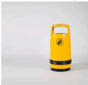
Michael Landy, Self Portrait As Rubbish Bin, 2012.

Sculpture on the Move, 1946-2016, Kunstmuseum Basel until 18 September More than a decade after surveying the history of painting in the 20th century, the Kunstmuseum Basel has staged its curatorial counterpart in three dimensions: Sculpture on the Move. The show inaugurated the museum's new 10,500 sq. m extension, designed by the local architects Christ & Gantenbein, in April. The expanded exhibition galleries trace the journey from the now-classic forms sculpted by the Modern masters Constantin Brancusi and Alberto Giacometti to the avant-garde ephemeral practices—captured here on film—of Gilbert & George, Gordon Matta-Clark and Bruce Nauman in the 1960s and 70s. Head to the Gegenwart building for sculptures from the new millennium by Maurizio Cattelan, Christoph Büchel and Danh Vo, among others. Michael Landy: Out of