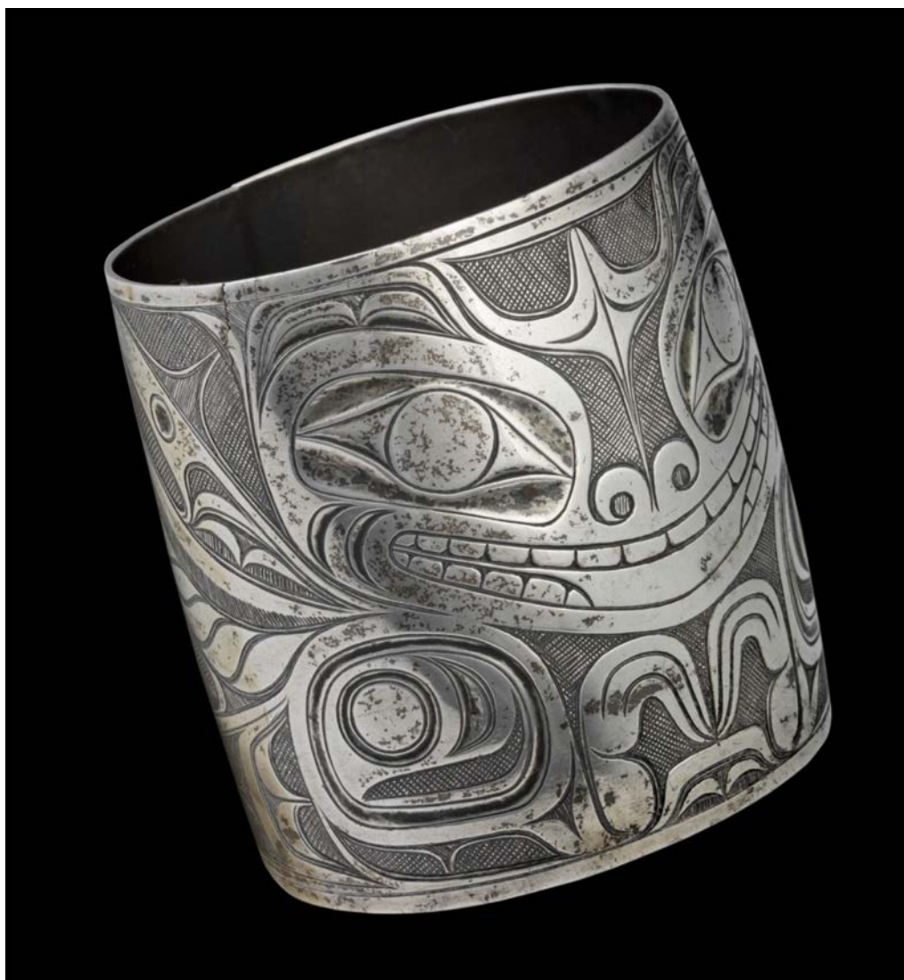
The Sea-Bear Bracelet, by Charles Edenshaw, at the National Gallery of Canada

Read more about all these works and exhibitions at