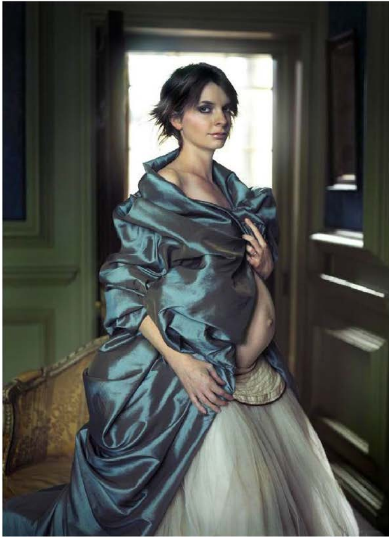
Portrait of Catrin Finch. by Edith Maybin. at Wall Space Gallery in Westboro.

Portrait of Catrin Finch, by Edith Maybin, Wall Space Gallery, July: The exhibition of emerging photographers at the Westboro gallery had much to choose from, and the jewel at the centre was Edith Maybin's sumptuous portrait of the very-pregnant Welsh harpist Catrin Finch. That sublime expression, that rich taffeta, that expansive belly — it's a photograph that commands respect. Click here to read more about the emerging photographers exhibition.