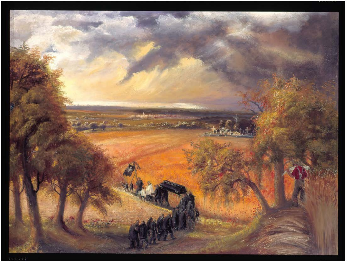
Otto Dix, Cemetery (Funeral Procession through Summer Landscape), 1941 © Estate of Otto Dix / SODRAC

they are dada-esque, and delightful proof that art can come from anyone. Click here to read more about Beck and the New Artist Showcase. ( http://ottawacitizen.com/entertainment/music/new-artists-a-refreshing-change-from-stodgy-establishment-saw-gallery )