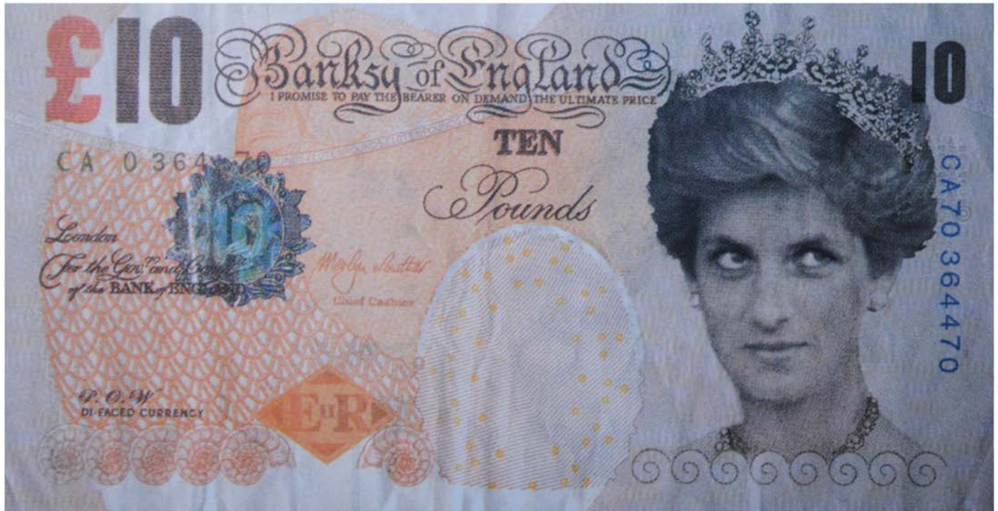
A fake 10-pound note by Banksy. Soon after he made his fake, more fakes of his fake were available on eBay, and all worth more than a real 10-pound note.

countryside — with storm clouds once again threatening the motherland and a farmer at the roadside with the reaper’s scythe — was powerful mix of natural beauty and man-made terror. Click here to read more about Dix and Jackson. ( http://ottawacitizen.com/entertainment/local-reviews/otto-dix-and-a-y-jackson-two-men-two-nations-and-one-unforgettably-horrible-war )