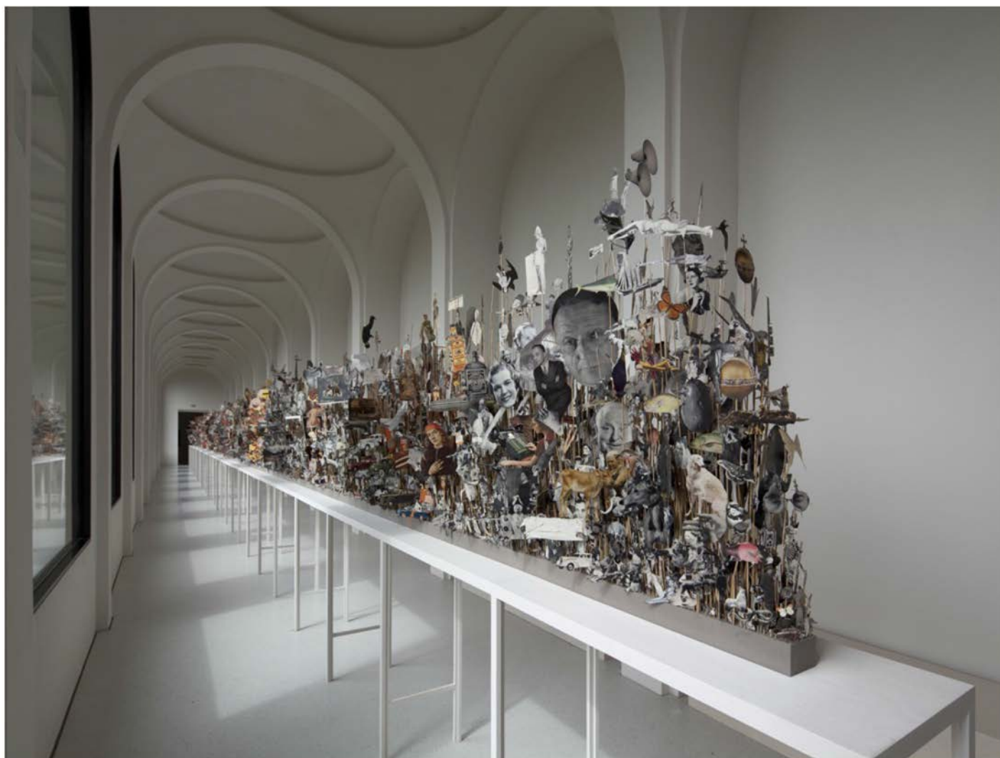
Leaves of Grass, by Geoffrey Farmer, at the National Gallery of Canada.

Leaves of Grass, by Geoffrey Farmer, National Gallery, October: Farmer's epic installation is the high point in Shine A Light, the National Gallery's biennial of recent, Canadian contemporary acquisitions. Farmer's crew clipped thousands of images from decades of Life magazine, and propped up the images on small sticks. Walk its length and a half-century of history and popular culture marches past, like a veritable parade of memory. Click here to read a review of Shine A Light. (http://ottawacitizen.com/entertainment/local-arts/the-national-gallery-shows-off-some-of-its-recent-purchases)