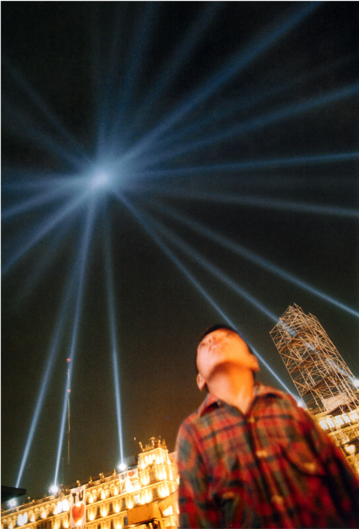
Vectorial Elevation, Relational Architecture 4, 1999-2000 18 robotic 7kW searchlights, 3 webcams, DMX:TCP/IP converter, Java interface, GPS tracker, web server, light sculptures up to 15 km high Installation millennium celebrations, Zócalo Square, Mexico City, 2000