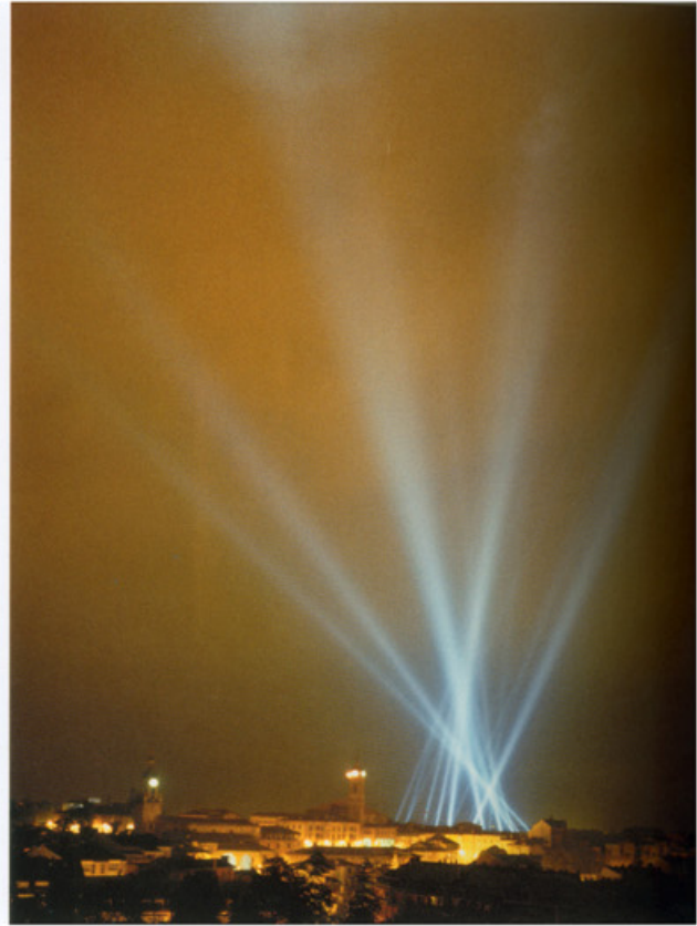
Vectorial Elevation, Relational Architecture 4, 2002 18 robotic 7kW searchlights, 4 webcams, DMX/TCP/IP converter, Java interface, GPS tracker, web server, light sculptures up to 15 km high Installation 'Artium Opening', Basque Museum of Contemporary Art, Vitoria, 2002