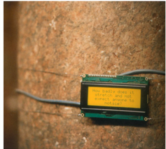
33 Questions per Minute, Relational Architecture 5, 2001 21 liquid-crystal displays, laptop computer, piezo electric tweeters, video projector, each LCD screen 6 x 10 x 3 cm Installation 7th Istanbul Biennale, Hagia Eirene, Turkey, 2001