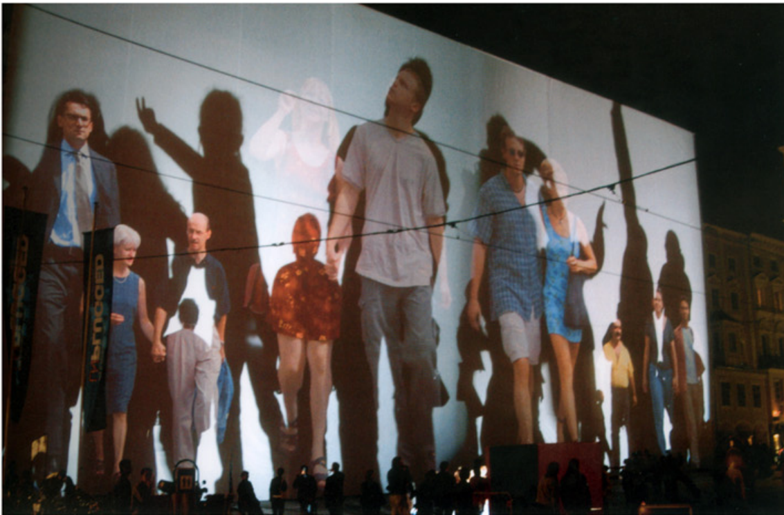
Body Movies, Relational Architecture 6, 2002 4 robotic 7kW xenon film projectors, custom-made shadow tracking system, 1,200 portraits on duratrans film, PA system, control computers, mirrors, 1,000 m 2 interactive projection Installation 'Unplugged', Ars Electronica Festival, Linz, 2002