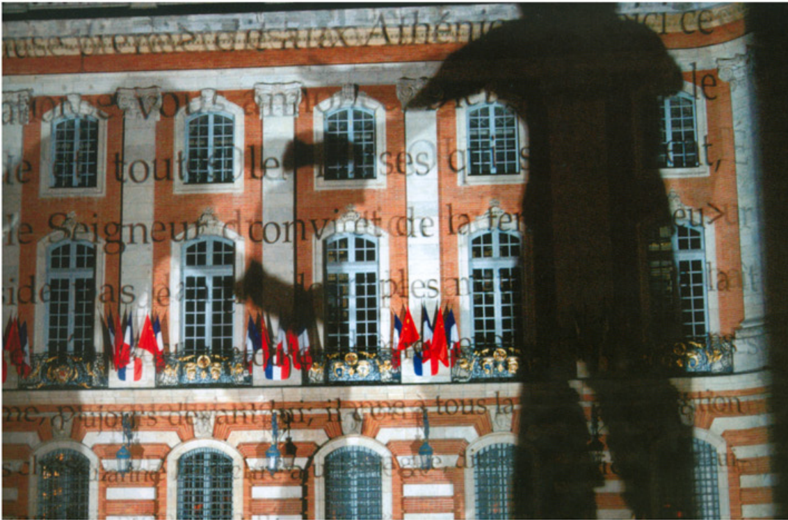
Two origins, Relational Architecture 7, 2002 4 robotic 7 kW xenon film projectors, computer controller, mirrors, 1,000 m 2 interactive projection of the Book of Two Origins , a heretic thirteenth-century manuscript; with the assistance of Jennifer Laughlin Installation 'Fragilities', Festival Printemps de Septembre, Place du Capitole, Toulouse, 2002