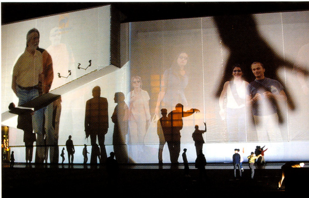
People interacting with Body Movies, Relational Architecture No.6 (2001) in a public square in Rotterdam, the Netherlands.