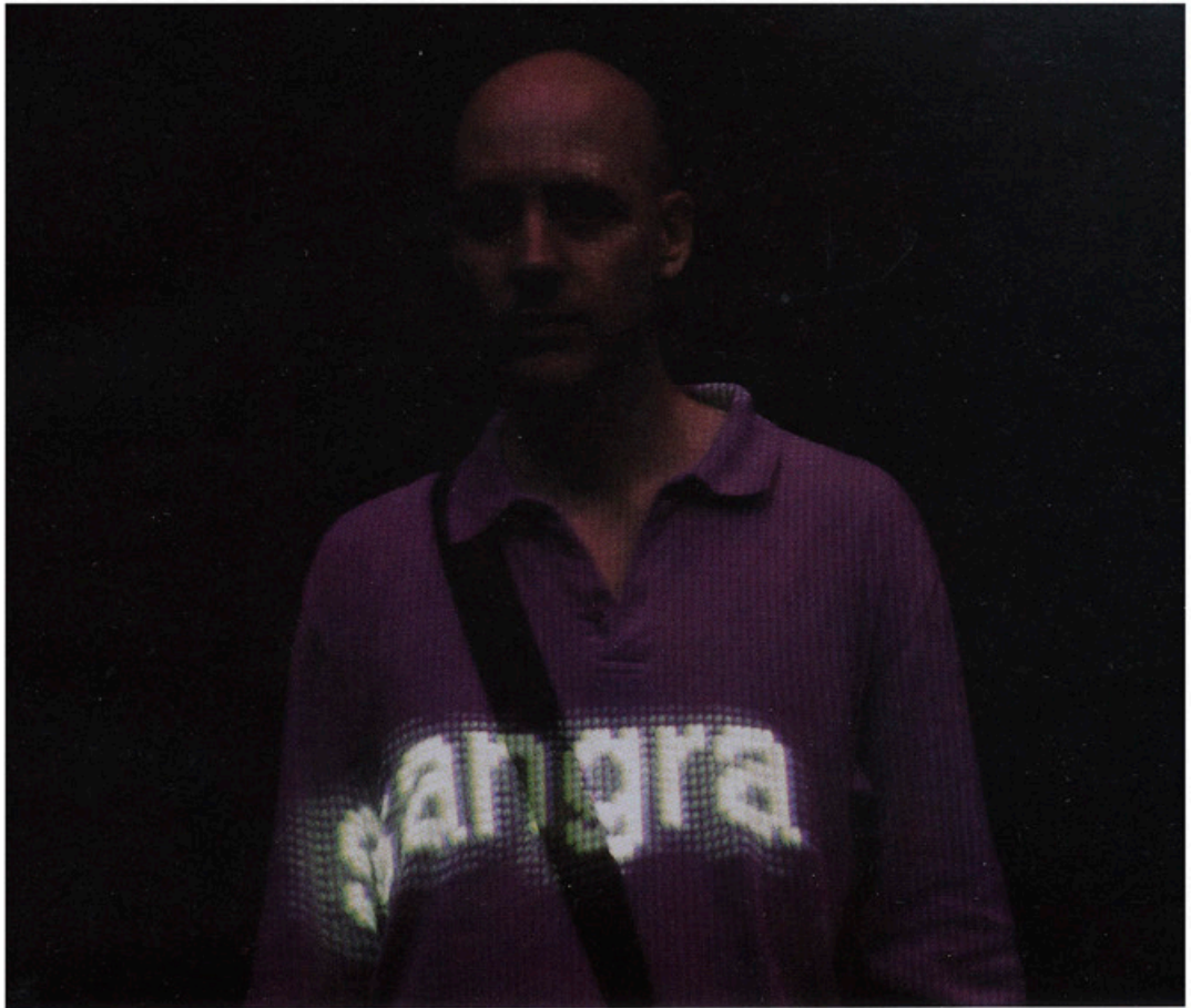
Submitted Public, 2005.