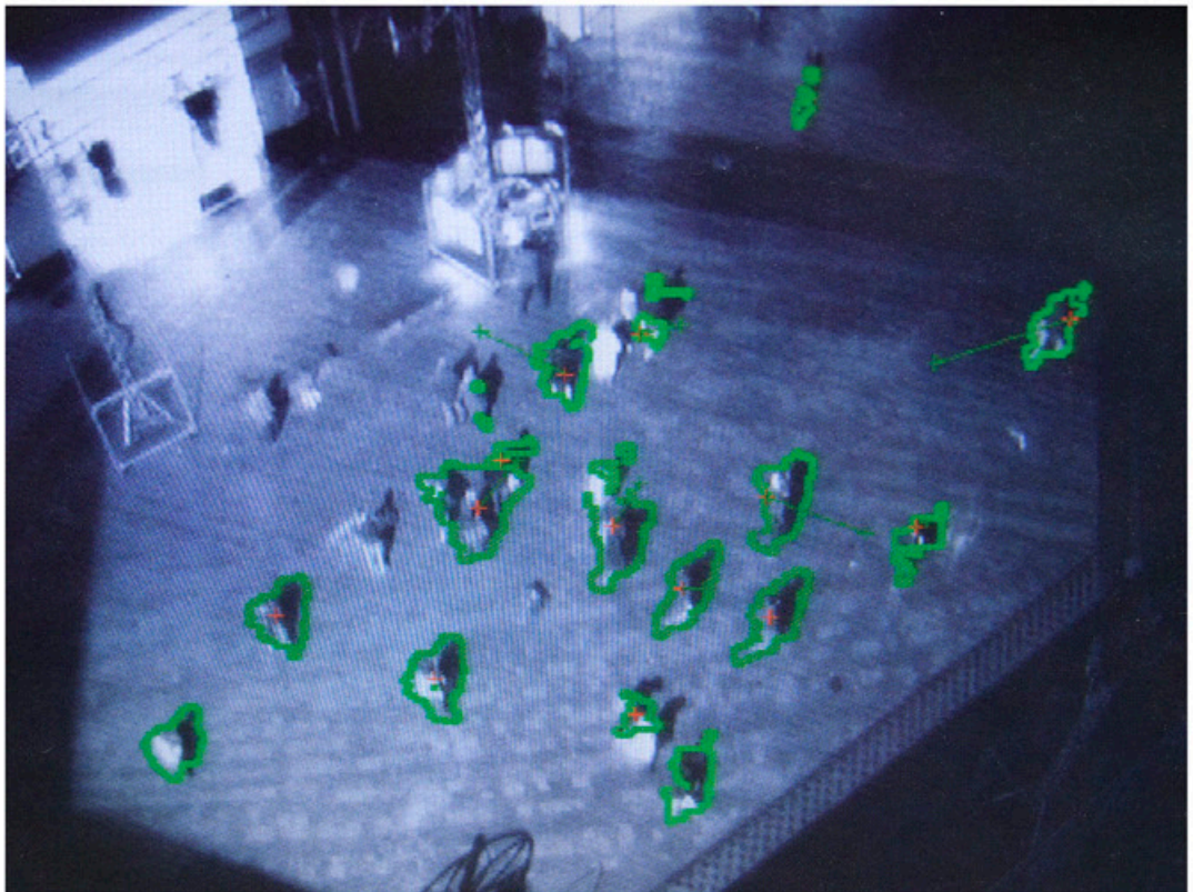
Under Scan, Relational Architecture 11, 2005-6.